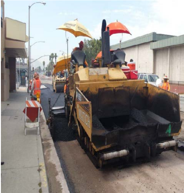
Repaving E Street