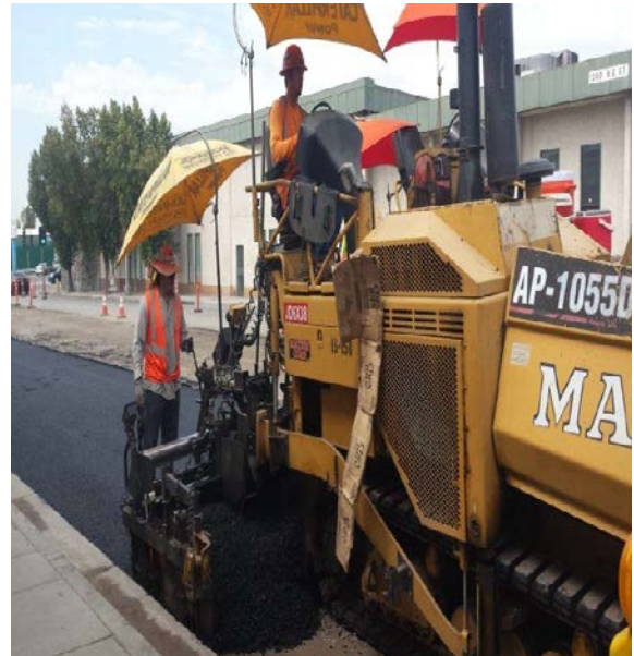
Repaving underway on E Street