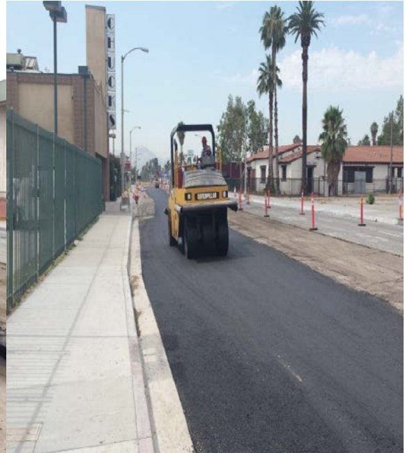
Fresh Paved Roadbed