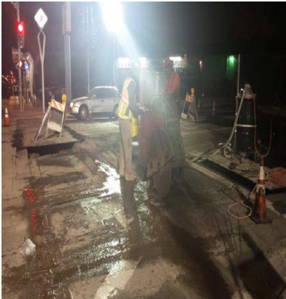
Saw cutting at Baseline Station