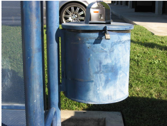
32 GALLON EXPANDED METAL TRASH RECEPTACLE