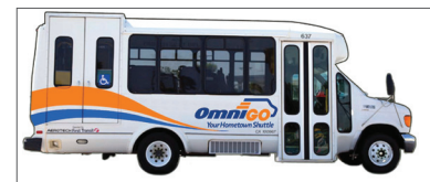
OmniGo vehicles, and service will be replaced Sept. 8.

Mini flex buses carry the same number of passengers as OmniGo vehicles did (12), as well as 2 mobility devices. Eventually the vehicles will be outfitted to carry up to 2 bicycles. Fares will remain the same as our big, 40-foot and sbX buses.