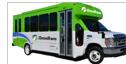
Omni “flex” mini buses will serve 300-series routes, and more.

There is also a change in the vehicles that serve these new routes. The white mini buses, (at right), with the unique gold and blue logo, that served all the OmniGo routes will be replaced by mini buses of the same size, but with a green, blue and white color scheme, (at left). These mini buses are what we call “flex vehicles.”